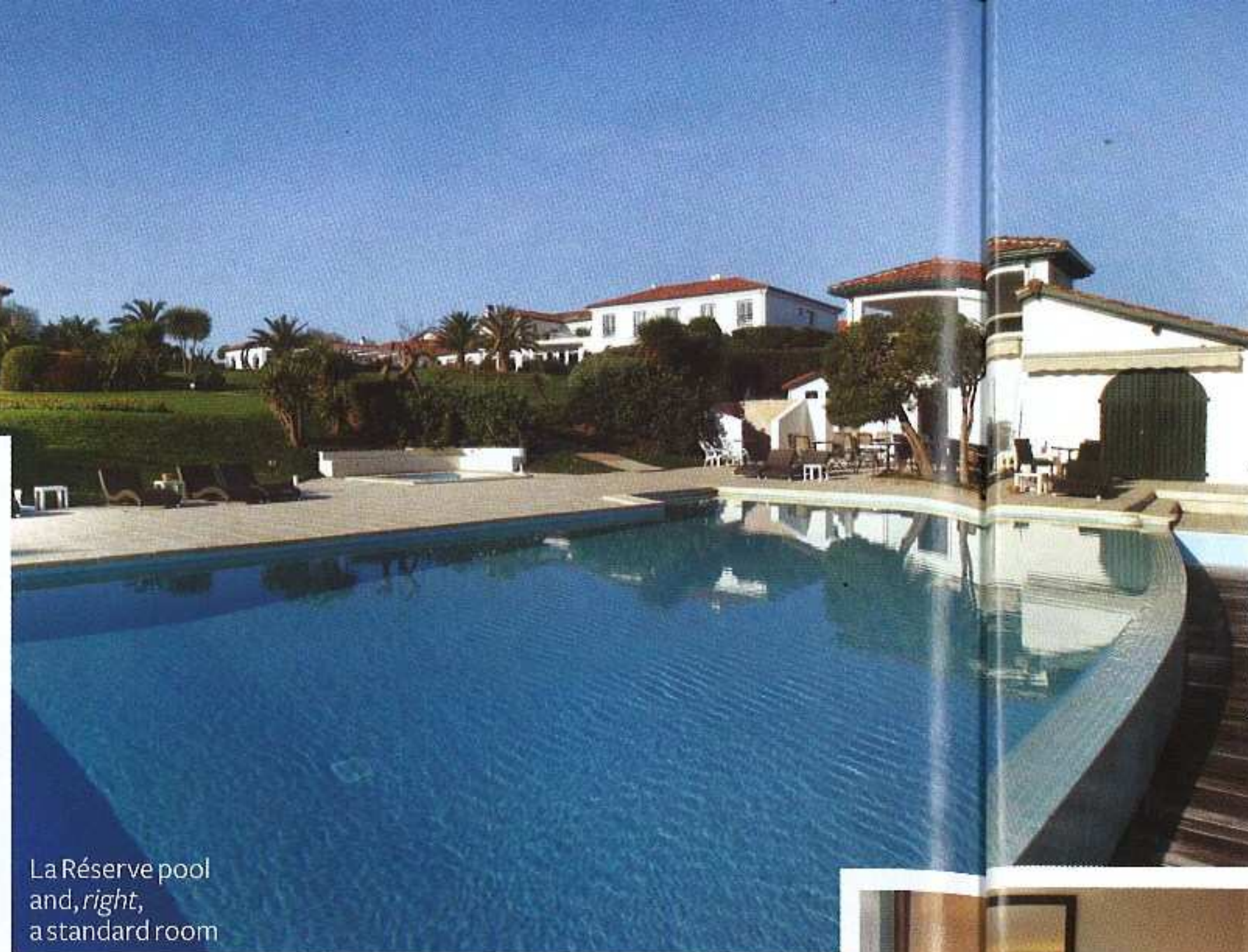
La Réserve pool and, right, a standard room

You won't need to hire a car if you're happy to simply wander back and forth from town, but if you do, there's scope to explore and