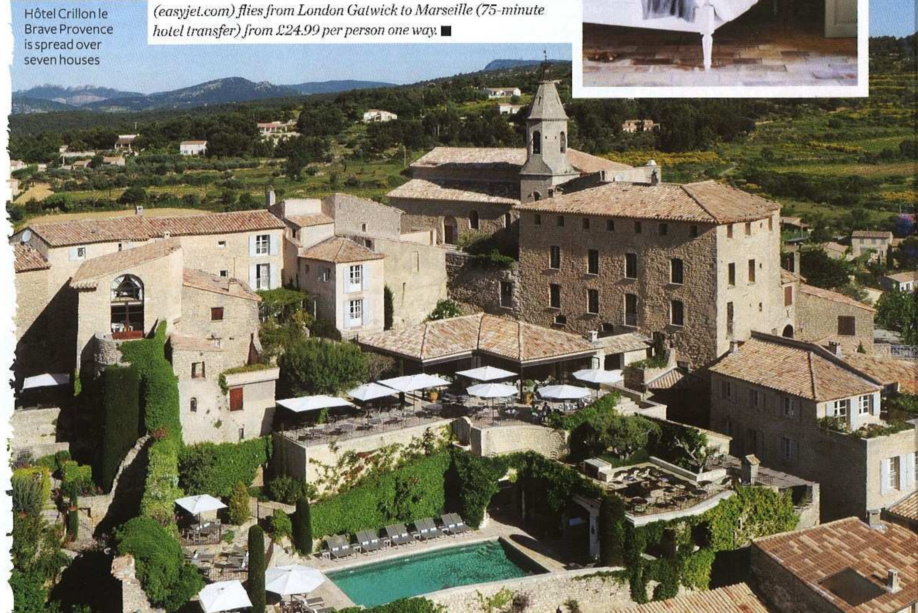
Hôtel Crillon le Brave Provence is spread over seven houses

If you're intent on activity, the hotel provides bicycles for a bucolic foray into the Normandy backwaters. Or go to Deauville for a day on the beach, a plate of mussels in a portside restaurant, or a film if you've blown into town during the festival. Lydia Bell Rooms at Les Manoirs de Tourgéville (00 33 2 31 14 48 68; lesmanoirstourgeville.com ) start at €140 (about £125) per night, b&b, based on two adults sharing. CityJet ( cityjet.com ; 0871 666 50 50) flies to Deauville three times a week from London City from £69, including taxes.