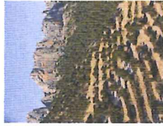
Above: old vines cling to steep terraces in Gigondas. Below: the fortress-like Palais des Papes in Avignon, where the popes lived in the 14th century

Florence Faumel runs one of the loveliest B&Bs in Châteauneuf-du-Pape and also represents the